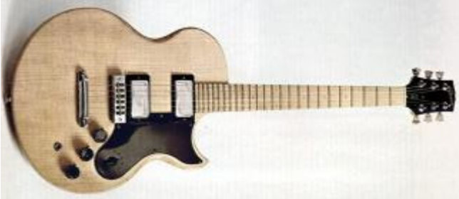
Gibson L6-S Custom guitar, 1974. Excellent condition, like new. Very collectible. Original hard case. $1,200