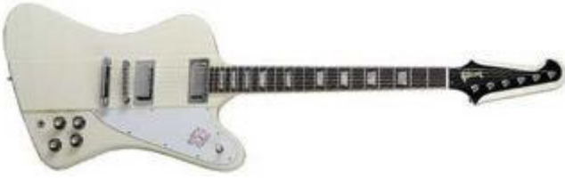
Gibson Firebird V (Firebird five) Guitar 1990. Flawless condition, like new. Custom pearloid pickguard (original white one included). $1,200