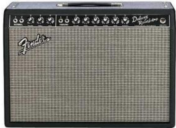
Fender Deluxe Reverb vintage tube guitar amplifier. 1965 "blackface" original, not a reissue. Very collectible, sounds great. $2,200