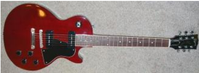
Gibson Les Paul Special guitar, 1991. Excellent condition, like new. 2 P-100 pickups. Sounds awesome. $1,000