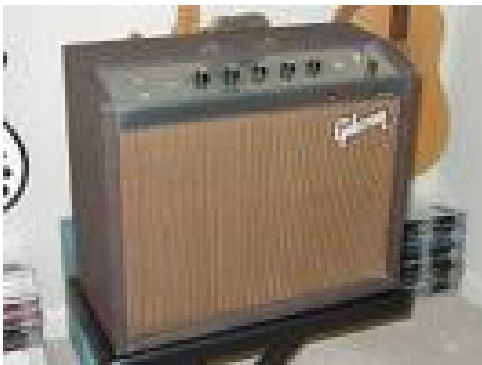
Gibson Scout Guitar Amplifier, mid-60's tube amp. A little rough cosmetically, but sounds good. $225